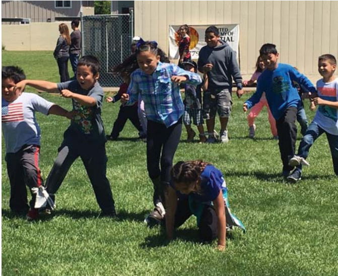
Students participate in a three-legged race at the Friends and Family Festival.

On Saturday, April 23, the Morgan Hill Federation of Teachers (MHFT) held their 1st Annual MHFT Friends and Family Festival. This four-hour event was held at P.A. Walsh STEAM Academy in Morgan Hill, and was organized in order to celebrate public education and neighborhood schools. Teachers, students and their families came out for a day full of entertainment, activities and information for the entire family.