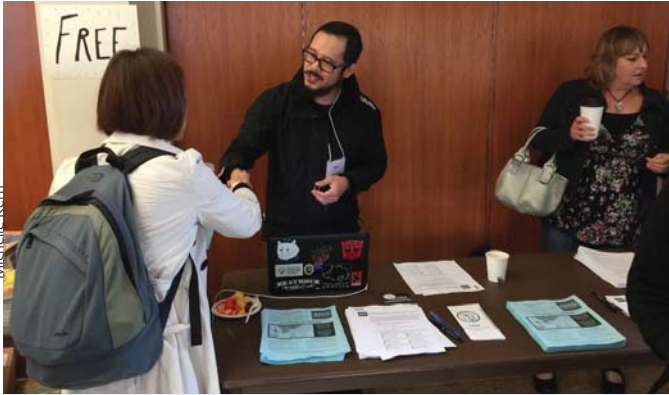
Local member volunteers give out free books and resources to conference attendees.

The Schools Our Children Deserve conference was held at Skyline College on Saturday, March 19, and featured speakers and panelists from all over San Mateo County, the greater Bay Area and from the national union based in Washington DC. The conference planners were assisted by staff from the