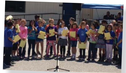
Jackson Academy of Math and Music third graders sing at the festival.

Solutions and Discovery Counseling providing information on their services for students and families, and Morgan Hill Library signing people up for library cards and discussing their current literacy projects. Foothill Community Health Center provided information on their free clinics and performed dental health screenings. The Learning and Loving Center was present as well, discussing the services they have available for non-English speaking community members. Kaiser Permanente and Second Harvest Food Bank distributed materials to support healthy students and families in our community, and the Morgan Hill Unified School District booth invited attendees to register for The Superintendent's Health Challenge – Easy as 1-2-3.