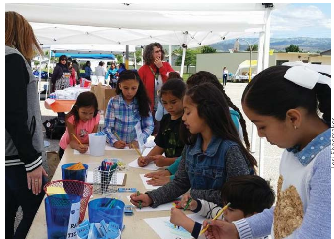
Creating cards at the Teacher Appreciation Day activity booth.