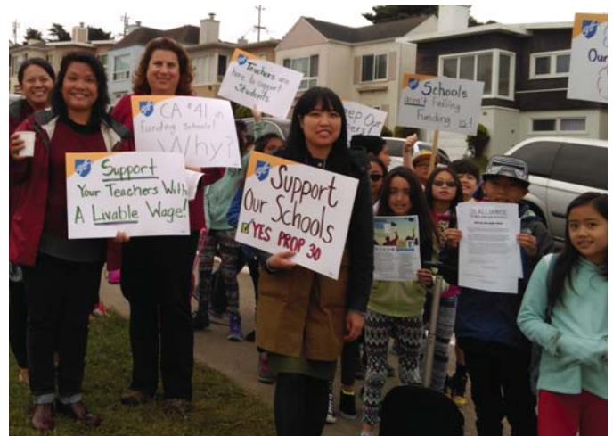
Teachers, students and parents say “fund the schools our children deserve” in Daly City as part of the national AROS walk-ins on May 4. #ReclaimOurSchools