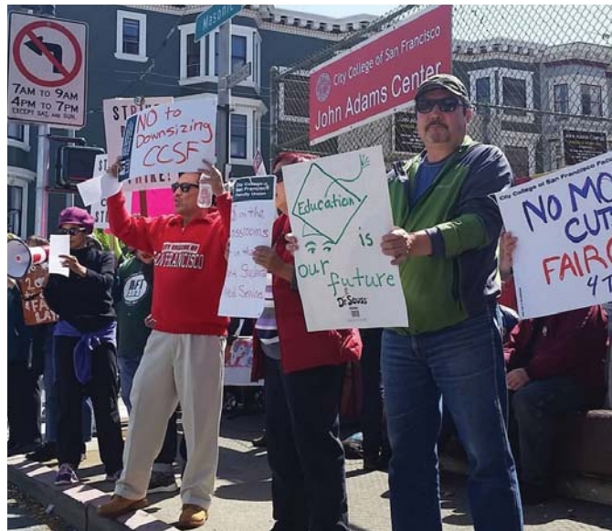
AFT local 2121 members and community supporters picket outside John Adams Campus in the Lower Haight, San Francisco.

Since the accreditation crisis our union has been shifting from a “service model” of unionism to an organizing model, focused on building power through