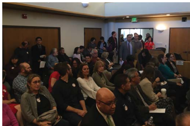
Packed house at the BOT meeting at the College of San Mateo. Standing-room only with over 60 faculty in attendance to win workload equity for members of San Mateo Community College Federation of Teachers, AFT Local 1493.