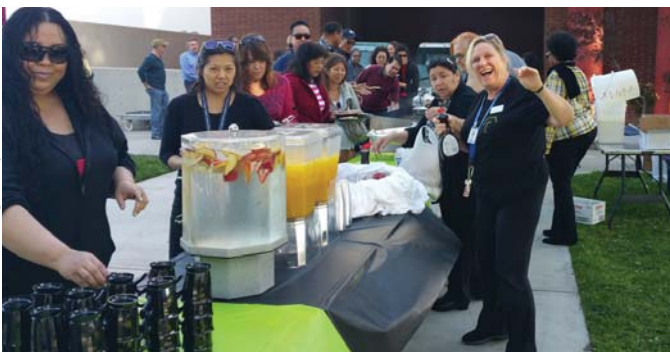
ECCE members join other El Camino College Staff at their well-attended spring pancake breakfast.

It was spring break and the members of El Camino Classified Employees Local 6142 (ECCE) were getting ready to enjoy a delicious pancake breakfast. That calm quickly subsided as enthusiastic employees began to take their breaks