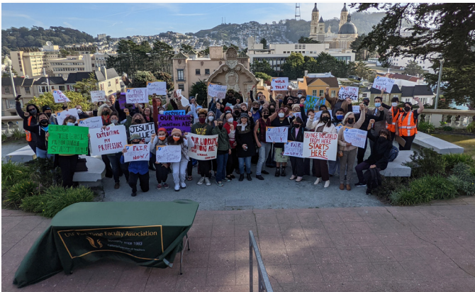
Students, faculty, staff and community members gather at Lone Mountain in support of part-time faculty getting a fair contract.

staff. The last year has seen increasing cooperation and solidarity among campus unions.