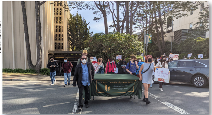
Students, faculty, staff and community members bring the negotiations table to management as they call for a fair contract for part-time faculty.

the planned rally and march the administration finally surfaced indicating that they would resume negotiations.